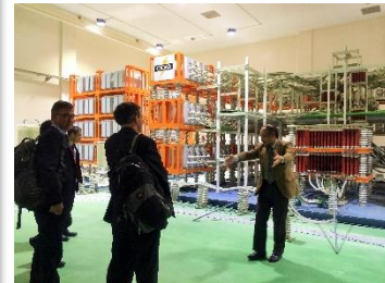
Internal Event: Industrial Tour National Composite Center Japan

AMAZON JAPAN LOGISTICS K.K.(USA) Oct. 2012(Tajimi/Gihu) Distribution service for AMAZON in Japan.