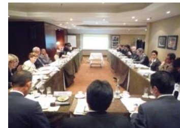
Abroad Project: Symposium: GREATER NAGOYA in France