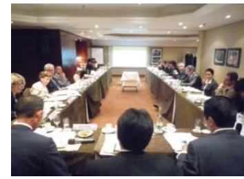
Abroad Project: Symposium: GREATER NAGOYA in France