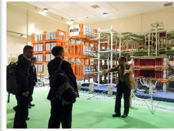
Internal Event: Industrial Tour National Composite Center Japan

AMAZON JAPAN LOGISTICS K.K.(USA) Oct. 2012(Tajimi/Gihu) Distribution service for AMAZON in Japan.