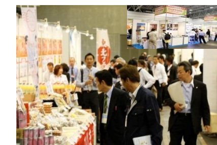
Reconstruction Support Corner for Eastern Japan