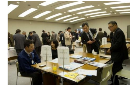
Global Salon by various participants