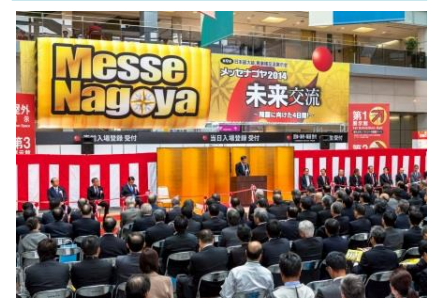
Opening ceremony (500 attendants)