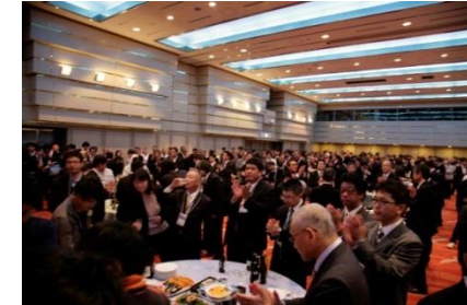
Opening Reception on Nov. 5th