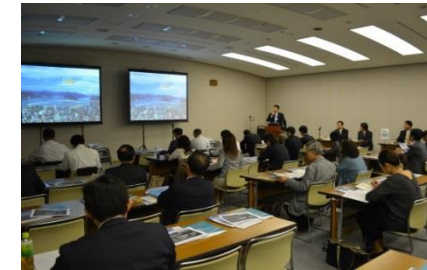
Global Seminar by overseas exhibitor