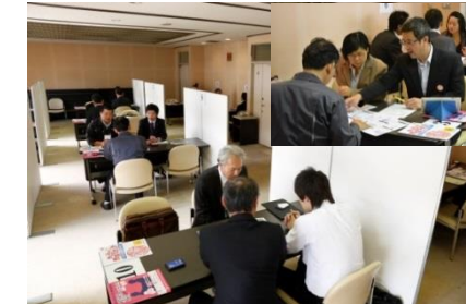
Pre-Arranged Business Matching Program, in which 576 companies Entered, 891 appoints arranged.