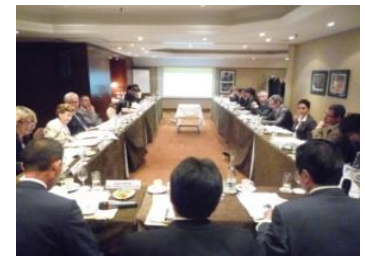
Symposium: GREATER NAGOYA in France