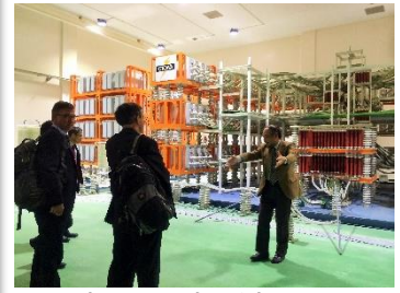
Internal Event: Industrial Tour National Composite Center Japan