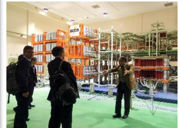
Internal Event: Industrial Tour National Composite Center Japan