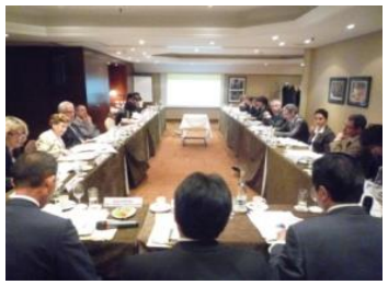
Abroad Project: Symposium: GREATER NAGOYA in France