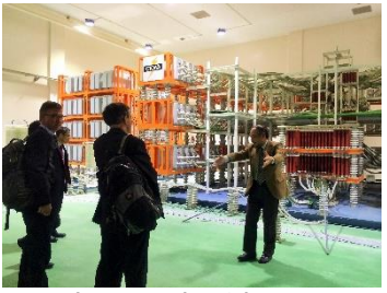
Internal Event: Industrial Tour National Composite Center Japan